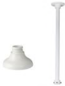
PFA106+PFB220C Adapter Plate + Ceiling Mount Bracket