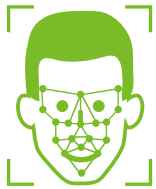
Access Control System

Our Pro series tripod turnstiles represent classic and safe way to protect your premises. They are used in various indoor environment applications. They fit perfectly as an economical option in the office buildings and other related applications.